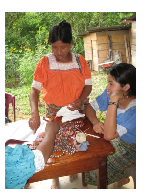
The ladies of Ixcan Creations doing inventory and labeling prior to sale.